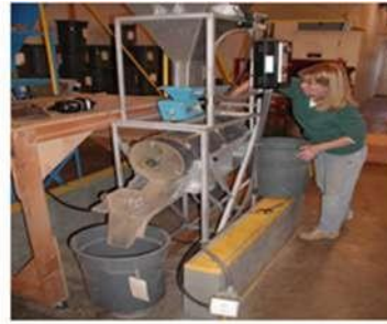
Cleaning and processing